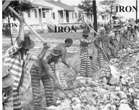
Former students dig for iron and iron smelting remnants in the blistering heat. I bet they could find a smelter in Hancock. Oh wait... BAZINGA.

...see All Glory to the Iron Toad? on back